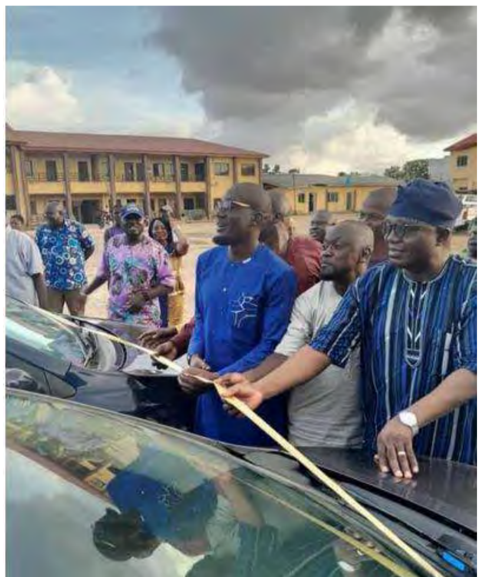
Presentaion of the vehicles

The councillors of Alimosho Local Government have received their official cars to aid their operation.