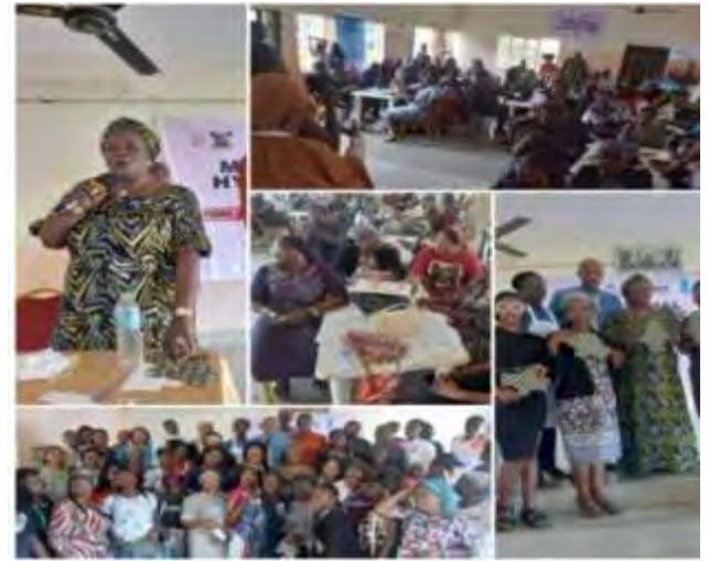
Participants at Sanitary making training

secondary school teachers and education officers, to extend what they have learned to their various schools and organisations. "This should be taken to our junior schools; the teachers who have been trained today should replicate it in their various schools."