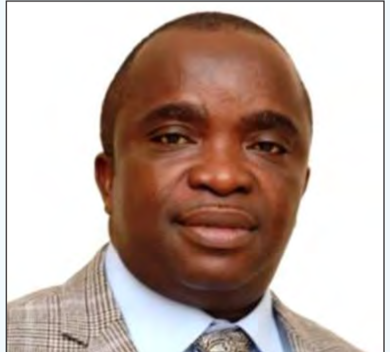
Hon. Abiodun Tobun