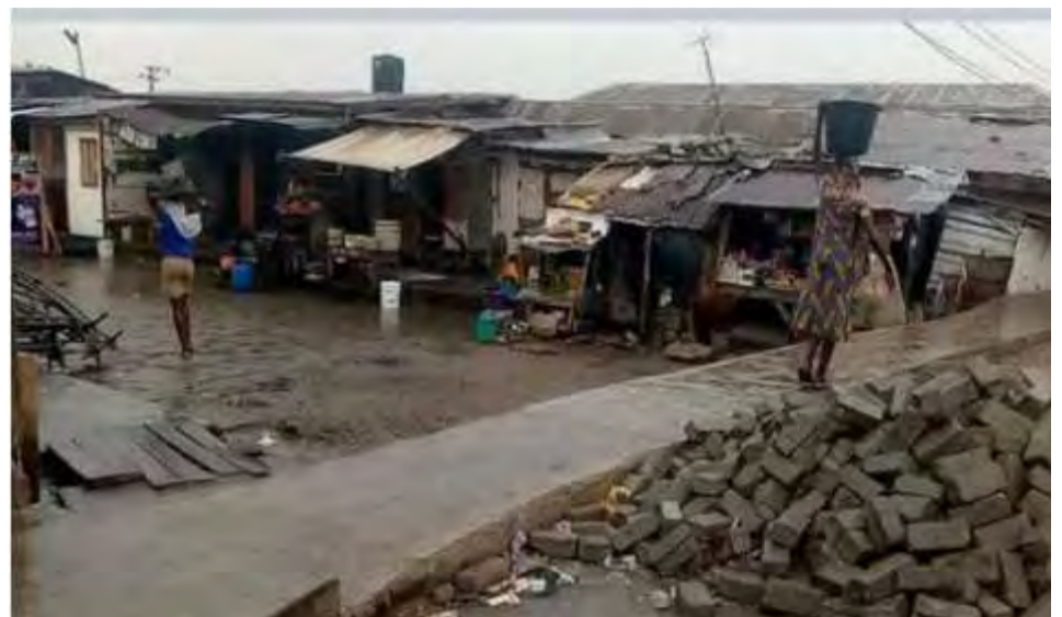
Apapa Iganmu road inspection