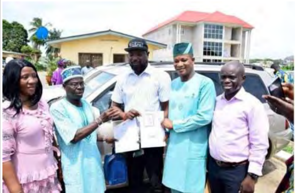
Badagry LG boss presents official cars to councilors

The event was graced and witnessed by reputable party leaders, monarchs, excos, management, families, and friends of beneficiaries.