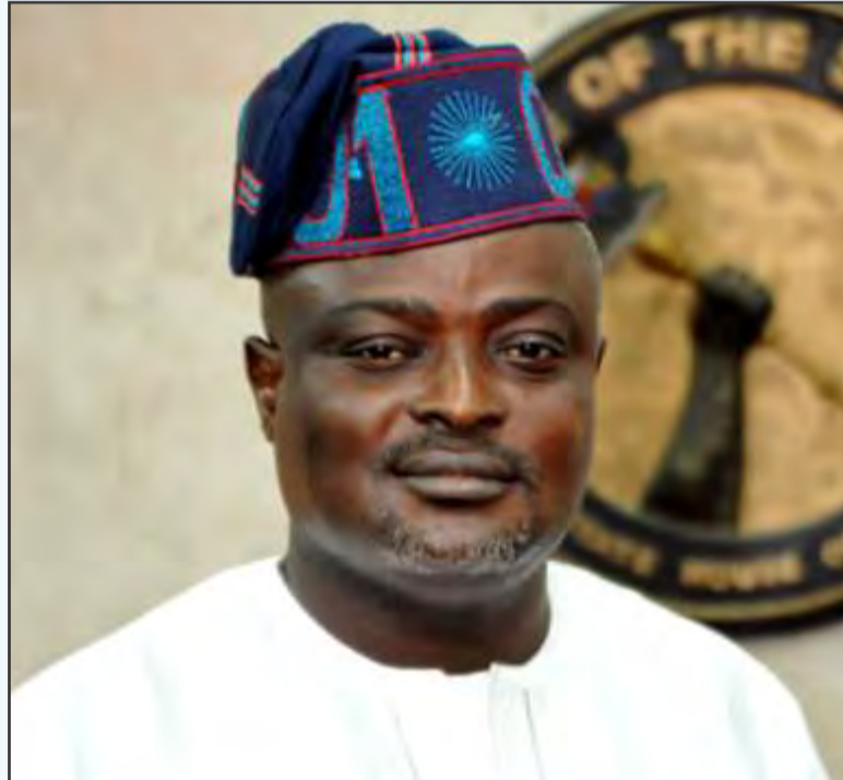
RT. Hon Mudashiru Obasa