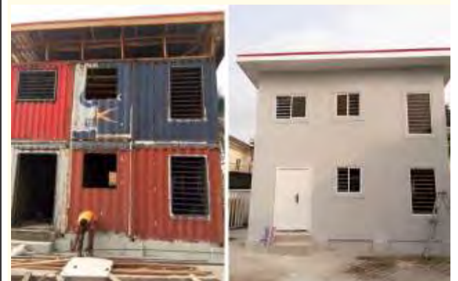
Converting residential to commercial building

He emphasised LASBCA's readiness to collaborate with Estate Executives and concerned citizens, for robust monitoring and enforcement activities in the State that will help uphold building regulations, promote safety, and maintain the unique character of each neighbourhood across the State.