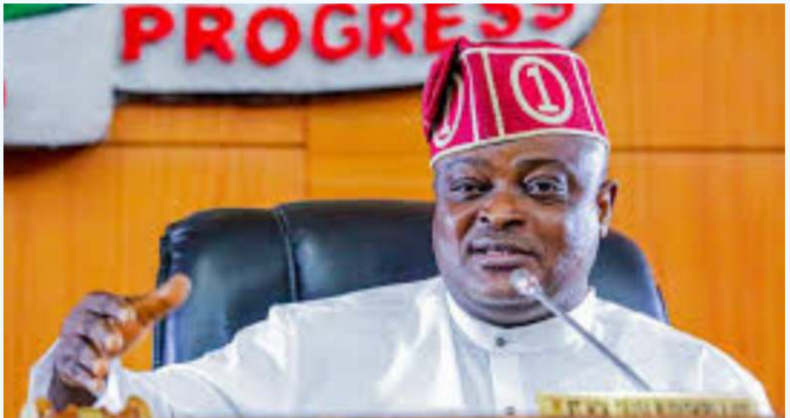
RT. Hon Mudashiru Obasa

The Governor urged the legislators to bring their unique value and perspective to bear in the debates of issues and policies in the assembly, stressing that the Government would achieve extraordinary results through collective efforts and cooperation. Sanwo-Olu thanked members of the Ninth Assembly, whom he said worked with his Government to ensure dividends of good governance were reaped by the people. He charged members of the 10th Assembly to meet and outperform the